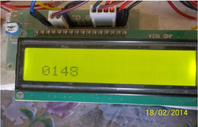
Fig: 3.3 Preloaded Values

once the number is stored the components such as GSM modem, lcd display, buzzer, motor all the hard ware components gets in on state and after the detection of fire they are going to respond simultaneously. We have given some preloaded values to light sensor if it crosses the preloaded intensity i.e. digital values it passes signals to microcontroller.