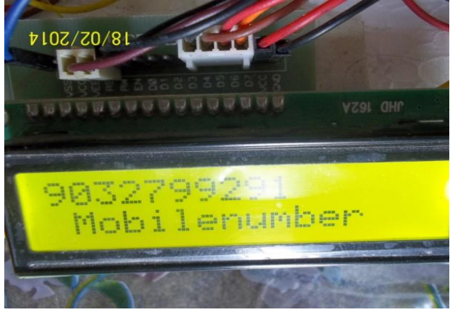
Fig: 3.1 Entering Mobile Number

To initialize the working of fire sensor through GSM modem we have to enter the mobile number through keyboard.