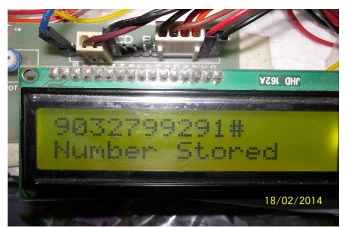
Fig: 3.2 Storing Of Mobile Number

After the mobile number is entered a '#' symbol is entered at the end of the number so that the number gets stored in EEPROM