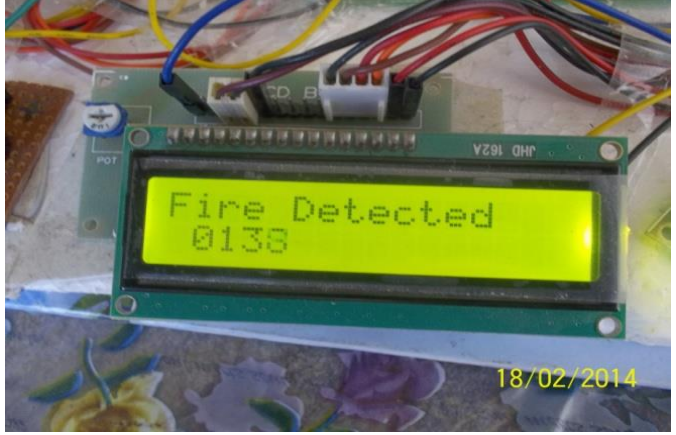
Fig: 3.4 LCD Display for Detection of Fire

http://www.ijesrt.com(C)International Journal of Engineering Sciences & Research Technology