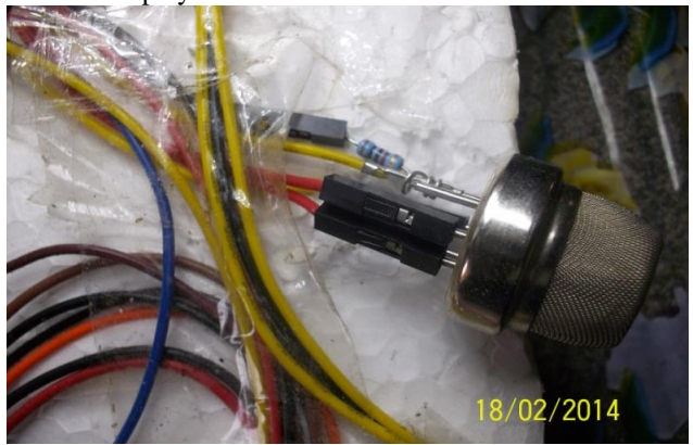
Fig: 2.1 Smoke Sensor (MQ135)

SBUF now sends them to GSM modem, now it sends the messages to the number specified about the accident. At the same time, buzzer and motor will be on automatically and motor sprinkles water to its surrounding area and it is also displayed on LCD. At mega 32 is interfaced to a GSM modem which is used to send messages. But only NMEA data coming out is read and displayed on LCD.