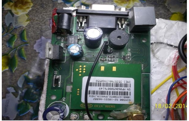
Fig: 2.3 GSM Modem

Global System for Mobile Communication (GSM) is a globally accepted standard for mobile communication. GSM is the name of a standardization group established in 1982 to create a common European mobile telephone standard that