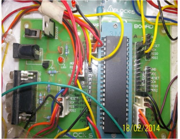
Fig: 2.4 AVR Programmer Board

The Atmel @AVR®AVR core combines a rich instruction set with 32 general purpose working registers. All the 32 registers are directly connected to the Arithmetic Logic Unit (ALU), allowing two independent registers to be accessed in one single instruction executed in one clock cycle. The resulting architecture is more code efficient while achieving throughputs up to ten times faster than conventional CISC microcontrollers. The ATmega32 provides the features: 32Kbytes of In-System following Programmable Flash Program memory with Read-While-Write capabilities, 1024bytes EEPROM, 2Kbyte SRAM, 32 general purpose I/O lines, 32 general purpose working registers, a JTAG interface for Boundary scan, On-chip Debugging support and programming, three flexible Timer/Counters with compare modes, Internal and External Interrupts, a serial programmable USART, a byte oriented Twowire Serial Interface, an 8-channel, 10-bit ADC with optional differential input stage with programmable gain (TQFP package only), a programmable Watchdog Timer with Internal Oscillator, an SPI serial port, and six software selectable power saving modes.